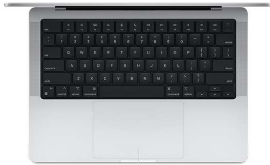
Force Touch trackpad